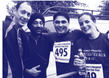
Everyone had a great time at the third annual St. James's Hospital Liberties Fun Run

In addition to this, the hospital continued to benefit from unsolicited private and corporate donations received from all over Ireland – given for the general benefit of the hospital and also for specialties throughout the hospital.