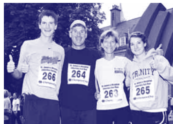
Everyone was a winner at the second St. James's Hospital Liberties Fun Run

In addition to this, the hospital continued to benefit from unsolicited private and corporate donations received from all over Ireland – given for the general benefit of the hospital and also for specialties throughout the hospital.