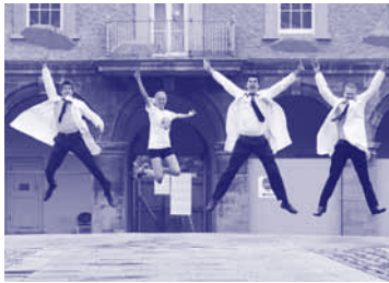
The new interns publicised the fourth St. James's Hospital Liberties Fun Run

Funds raised through Foundation fundraising during 2012 have been reserved to benefit the newly-established heart support service and also for The National Burns Unit. In addition to this, the hospital continued to benefit from unsolicited private and corporate donations received from all over Ireland – given for the general benefit of St. James's and for specialties throughout the hospital.