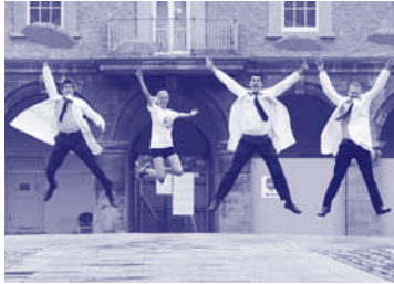
The new interns publicised the fourth St. James's Hospital Liberties Fun Run

Funds raised through Foundation fundraising during 2012 have been reserved to benefit the newly-established heart support service and also for The National Burns Unit. In addition to this, the hospital continued to benefit from unsolicited private and corporate donations received from all over Ireland – given for the general benefit of St. James's and for specialties throughout the hospital.