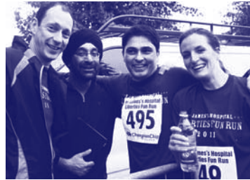
Everyone had a great time at the third annual St. James's Hospital Liberties Fun Run

In addition to this, the hospital continued to benefit from unsolicited private and corporate donations received from all over Ireland – given for the general benefit of the hospital and also for specialties throughout the hospital.