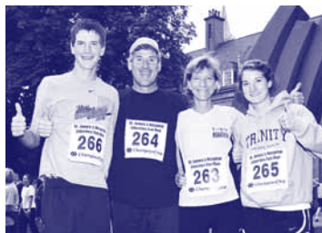
Everyone was a winner at the second St. James's Hospital Liberties Fun Run

In addition to this, the hospital continued to benefit from unsolicited private and corporate donations received from all over Ireland – given for the general benefit of the hospital and also for specialties throughout the hospital.